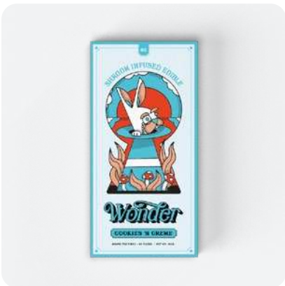
Cookies 'N Creme 6g Psilocybin / package 250mg Psilocybin / piece