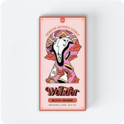
Blood Orange 6g Psilocybin / package 250mg Psilocybin / piece

Wonder chocolate is an easy way to integrate psilocybin into your holistic wellness routine. Our chocolate bars are made with the highest quality chocolate and crafted to provide just the precise measurement of the world's most beloved psychedelic mushroom, psilocybe Cubensis. They are third party tested, so that you can precisely achieve your desired state of mind.