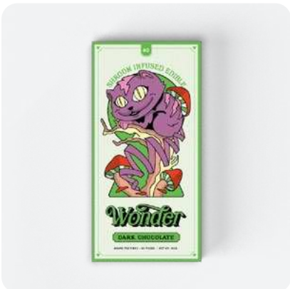
Dark Chocolate 6g Psilocybin / package 250mg Psilocybin / piece