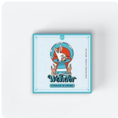
Cookies 'N Creme 3g Psilocybin / package 250mg Psilocybin / piece