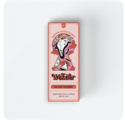
Blood Orange 1g Psilocybin / package 250mg Psilocybin / piece