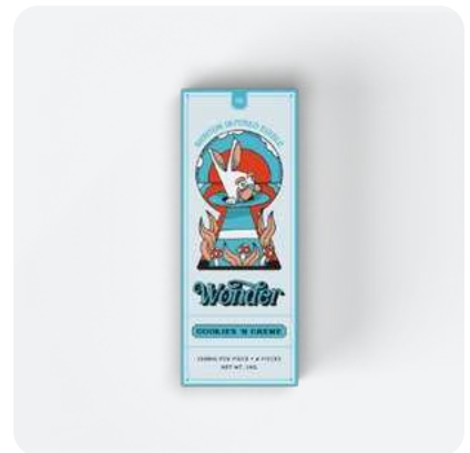
Cookies 'N Creme 1g Psilocybin / package 250mg Psilocybin / piece