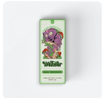
Dark Chocolate 1g Psilocybin / package 250mg Psilocybin / piece