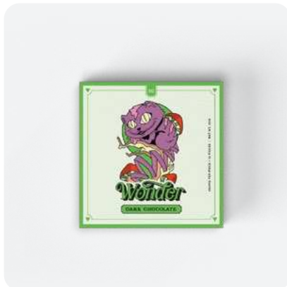
Dark Chocolate 3g Psilocybin / package 250mg Psilocybin / piece