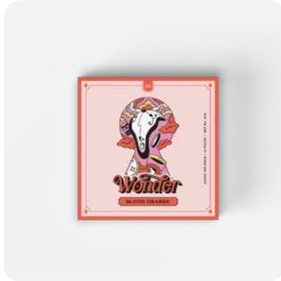
Blood Orange 3g Psilocybin / package 250mg Psilocybin / piece