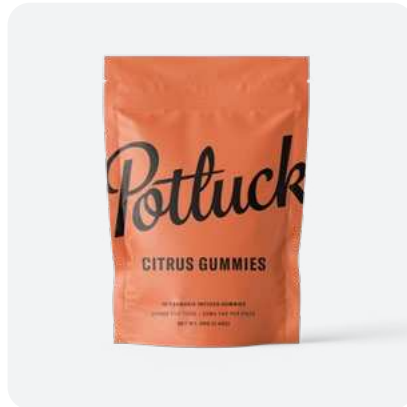
Citrus Gummies 200mg THC / package 20mg THC / piece