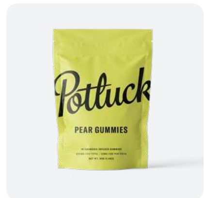
Pear Gummies 200mg CBD / package 20mg CBD / piece