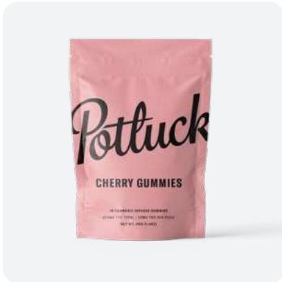
Cherry Gummies 200mg THC / package 20mg THC / piece

Potluck cannabis gummies are as precise as gummies get. They are crafted with expert precision to perfectly combine great taste and the perfect dose. We use only all-natural ingredients including a highly monitored full-spectrum cannabis oil.