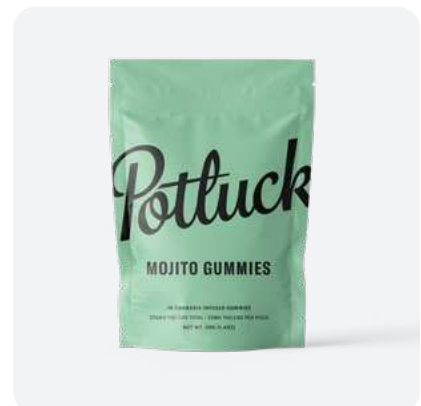
Mojito Gummies 200mg THC:CBD / package 20mg THC:CBD per piece