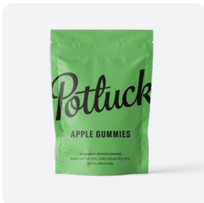
Apple Gummies 200mg THC:CBD / package 20mg THC:CBD per piece