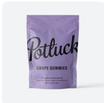
Grape Gummies 200mg THC:CBD / package 20mg THC:CBD per piece