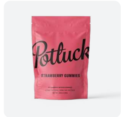
Strawberry Gummies 200mg THC / package 20mg THC / piece