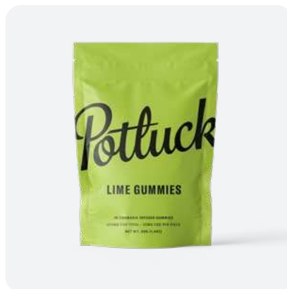
Lime Gummies 200mg CBD / package 20mg CBD / piece