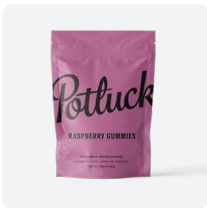
Raspberry Gummies 200mg THC / package 20mg THC / piece